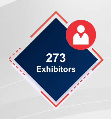
The 5<sup>th</sup> edition of India Manufacturing Show 2022 reasserted its Brand Equity once again as being the Top-Notch Manufacturing Show in India.